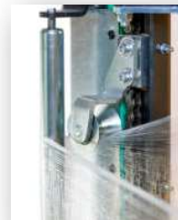
Film roping, with chain drive