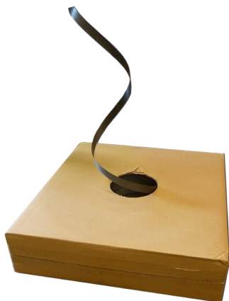
Dispenser Box for hand strapping use