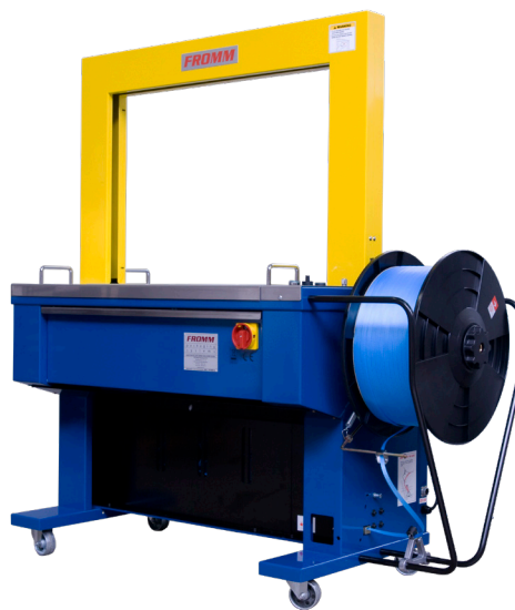
Larger rolls for use with FROMM strapping machines